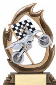
B I K E S