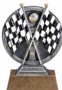
R A C I N G