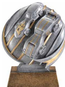
C A R S